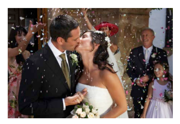
Fig. 7. Marriage as a deep symbolic unification between two partners

The symbol for this will be to the side in close proximity of the community spot (stage 3), because it is the result of it. This is about the meaning in our adult life of the concreteness of marriage, relationship, physicality and sexuality, love in hope of reciprocity; the flow that goes out and the flow that comes towards us, overwhelms us, reversal of orientation, willingness to bear the fruits of the field.