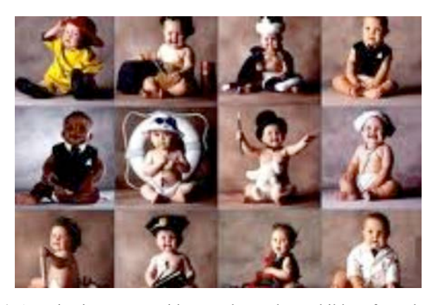
Fig. 4. A projection screen with recently newborn children from the town

There will also be offered the internet service to upload photos (or birth cards; see Fig. 4 ) of newborns from the whole environment (e.g. city of Eindhoven). This will make this stage into a spot where the whole town symbolically commemorates its origin and birth. It could unite people and in particular the citizens of Eindhoven.