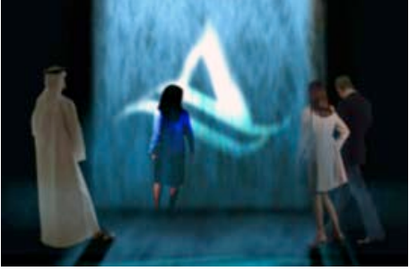
Fig. 3. A waterfall is projected on a Fog-Screen (left). The entrance of the interactive experience through a Fog-Screen [18] (right)

There will also be offered the internet service to upload photos (or birth cards; see Fig. 4 ) of newborns from the whole environment (e.g. city of Eindhoven). This will make this stage into a spot where the whole town symbolically commemorates its origin and birth. It could unite people and in particular the citizens of Eindhoven.