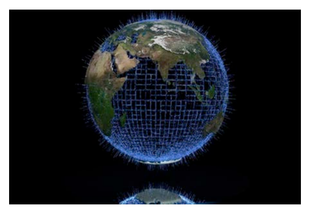
Fig. 5. A holographic project of the earth on the table

ing of the Eucharistic remnants of bread would be brought back to this table, it would focus the attention more like it was before. Burning fire (candle, oil lamp or holographic projections) will support the symbolic presence.