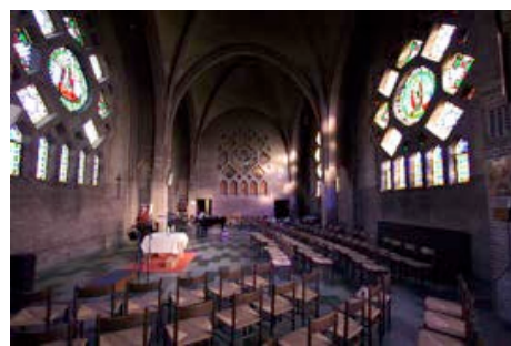
Fig. 2. The front side (left) and main hall (right) of the Eindhoven Student Chapel