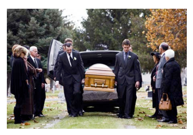
Fig. 10. A coffin as last shelter on earth to protect the dead body, carried by family and friends to its final destination

At the end of the whole experience under the closing gothic arc at the end of the main hall (see Fig. 2 ) we will finally find the last gateway. Every human being comes into the world alone, passes through the community and goes the last part of the road alone again. In all cultures there are ways of saying farewell and trying to escort man in her/his last phase as far as possible. In the Catholic tradition s/he was strengthened with forgiveness, anointment and food for the journey (i.e., viaticum; see Fig. 10 ).